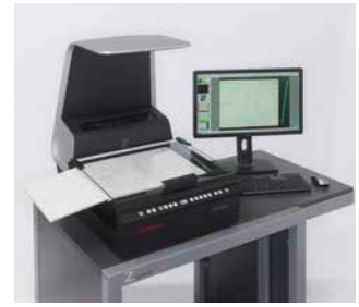
■ OS 15000 Advanced Plus: Scanning of large formats