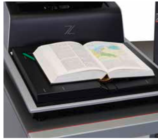
■ Book cradle OS 15000 Comfort