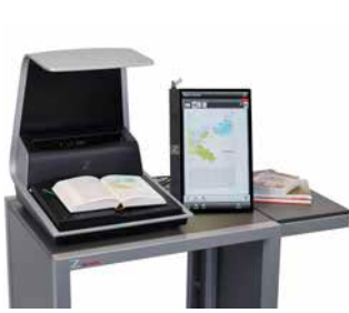
■ OS 15000 Comfort with touch panel and zeta Software