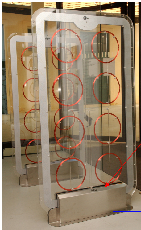
Certus RFID Long Reader LR2011

A typical EM – RFID installation looks like this (see pic).